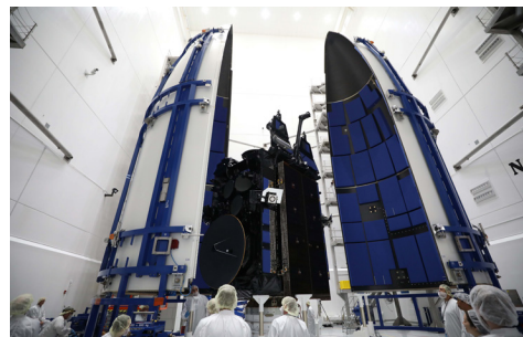
Spacecraft encapsulation at Astro-tech's state-of-the-art facilities

With the introduction of Vulcan, ULA will provide higher performance and greater affordability while continuing to deliver unmatched reliability and precision. Vulcan's evolutionary design coupled with innovative technology provides one system for all missions.