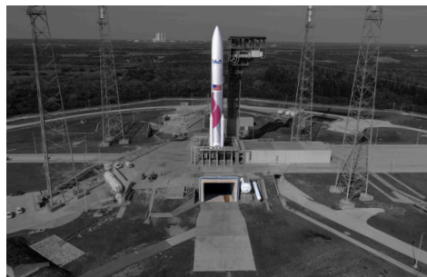
Processing and launch from Cape Canaveral's Space Launch Complex-41